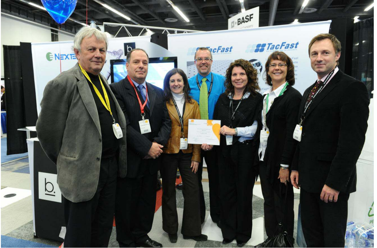
Beaulieu Canada for its product TacFastMD / LocPlateMC