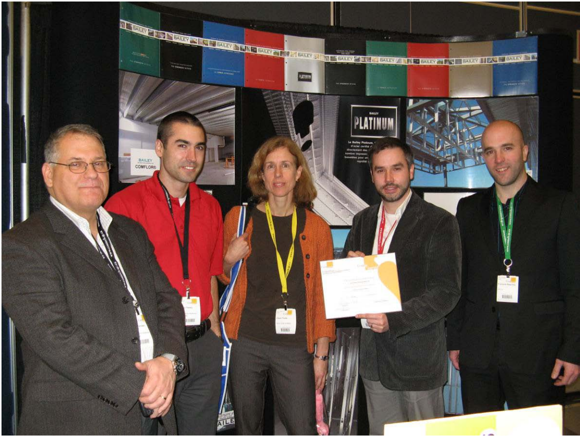
Les produits métalliques Bailey Itée for its product Comslab