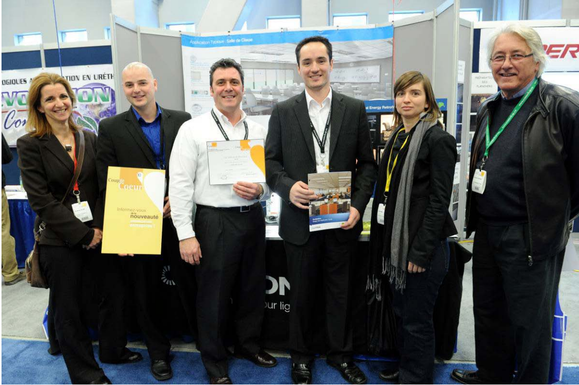
Lutron inc. for its product Hi-lume A-Series LED driver