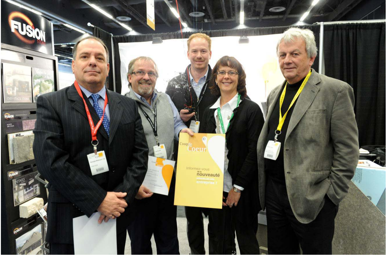
Broadleaf Logistics for its product Form-A-Drain®