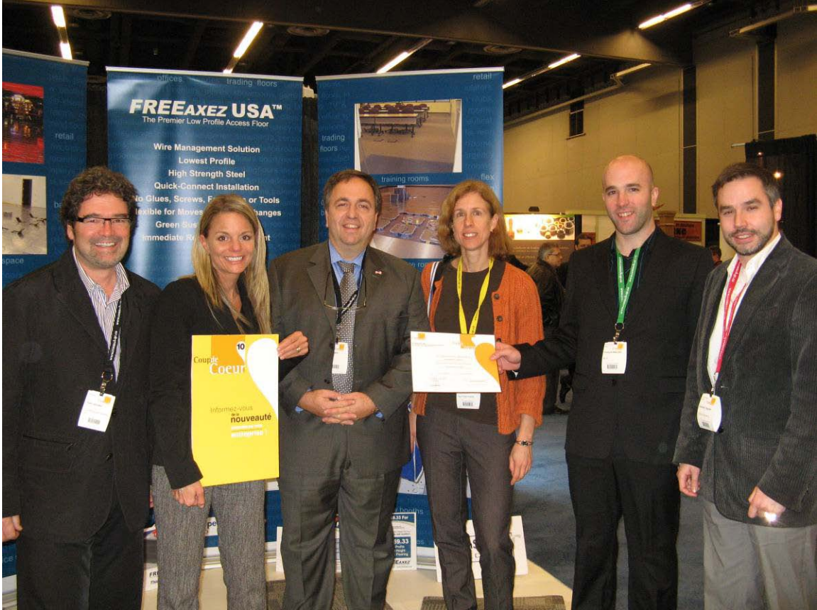
Couvre-Planchers Labrosse inc. for its product Free Axez